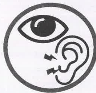
Ear or eye infection